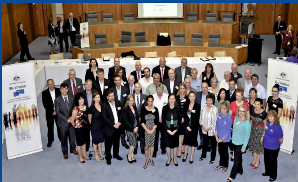
ASBAS service providers with the Minister for Small Business & Assistant Treasurer, the Hon. Kelly O'Dwyer