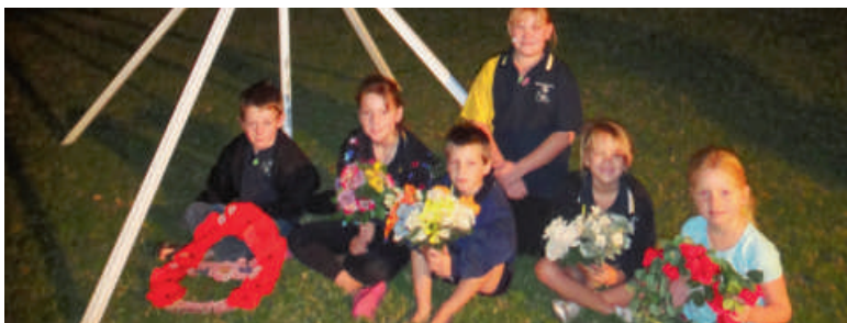
Dawn Service at Gregory Downs Station.