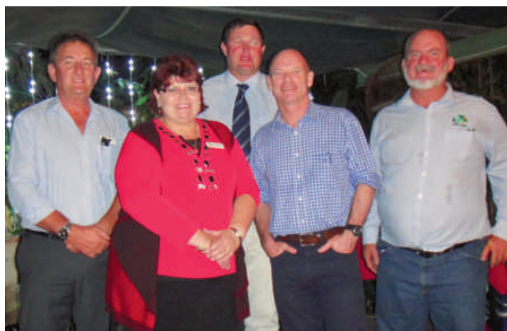
Premier Campbell Newman and the Burke Shire Councillors.