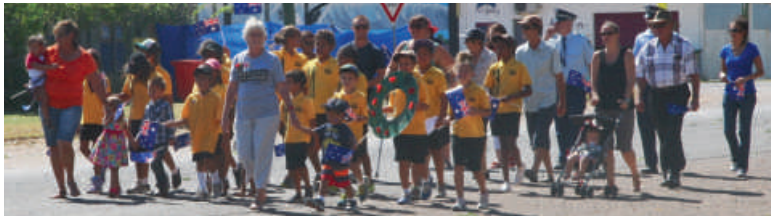
Anzac Day March in Burketown.

Burke Shire Council PO Box 90 BURKETOWN QLD 4830