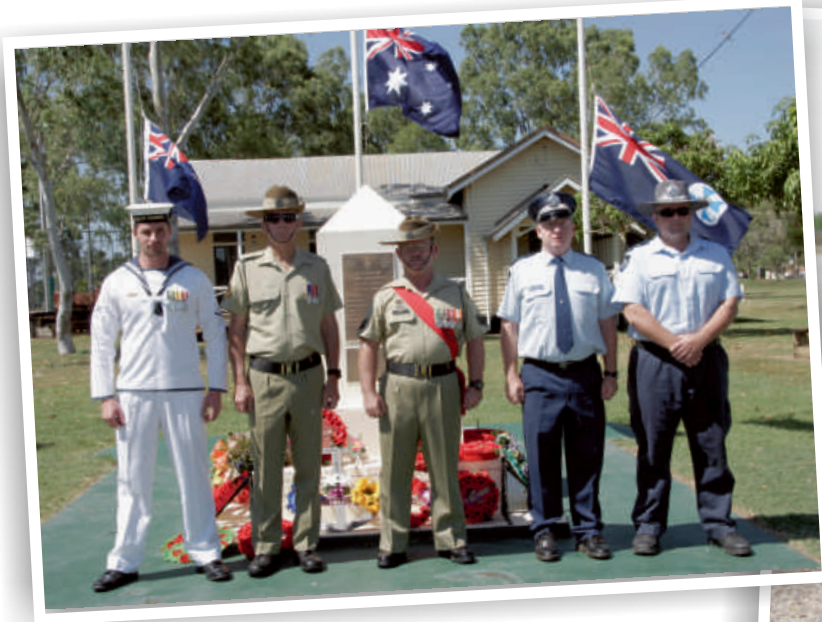
Below – Attendees of Anzac Day Ceremony gathered around the Cenotaph for the Morning Service.

With Anzac Day falling at a difficult time on the calendar this year, coinciding with Easter and the Fishing Competition, it was great to see the 65 attendees for the breakfast and 80 for the luncheon. It is immensely important for the young, old and all in between to commemorate those who have fallen or put themselves on the line for us all. A special thank-you is extended to all those wreath-layers, volunteers and attendees who were not mentioned in this article. Anzac Day is a special day and would not have been such a great success without your help and attendance!