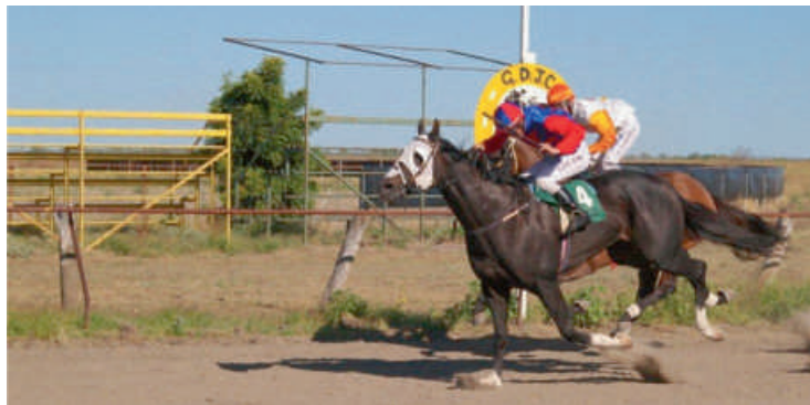
Columba Catholic College race won by Flickering Storm.