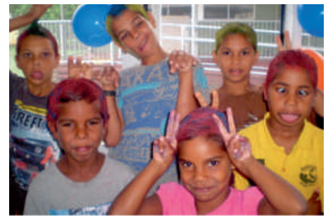
Above – Council Depot boys getting their Crazy Hair Styles