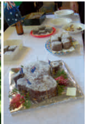
Lamington Bake Off entries.

Burke Shire Council PO Box 90 BURKETOWN QLD 4830