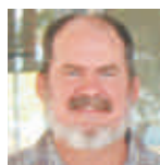
Deputy Mayor Ernie Camp

My thoughts go out to those affected by the recent flooding in Queensland and those in the path of Cyclone Yasi. They have endured terrifying moments, heartfelt loss and face a mammoth task to rebuild lives and communities.