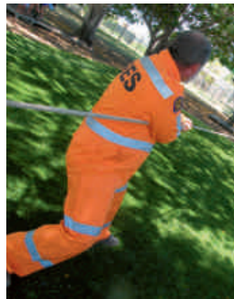
Ernie Camp takes on the kids in the Tug Of War.