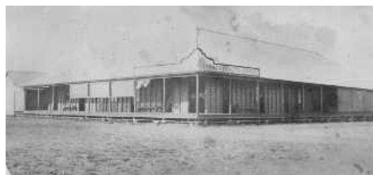
The Commonwealth Hotel in its heyday - 1926