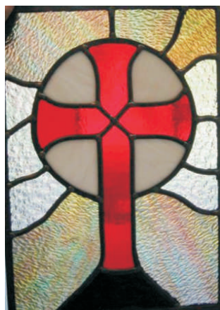
Leadlight windows - Cross by Annie Clarke