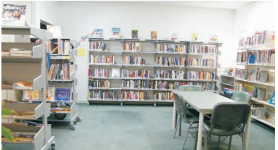
New set up at the Burke Shire Library.