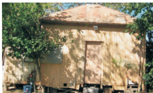
Last remnants of the old Commonwealth Hotel