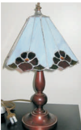
Copperfoil - Lamp by Debbie Glyde