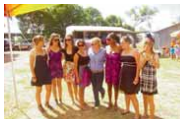
Students of Columba School supporting the 'Columba Catholic College Class 4 Handicap