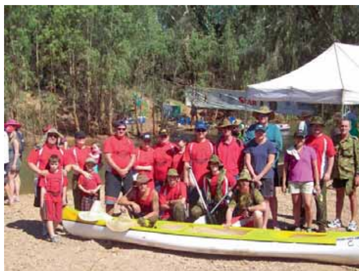
This year at the Gregory River Canoe Race, the Delta Company 51 FNQR Canoe team did very well, over all the team came 3rd in our division, the Corporate division. This year not only did we enter a team in the race, but we also provided the safety communications for the event. It was a busy time for our soldiers but all had a very good time and are looking forward to next years event.