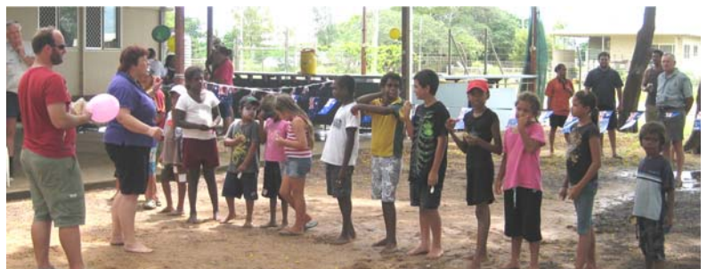
Kids line up for their instructions for the Iron Kid race.