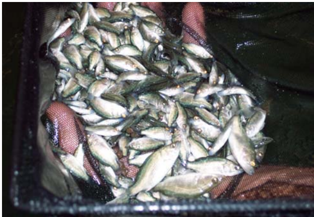
From this size