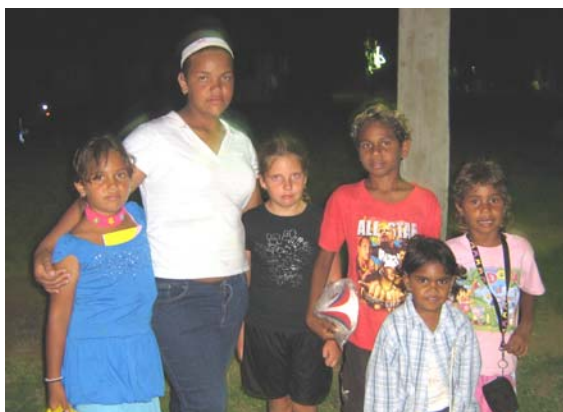
Judges for the Xmas lights competition