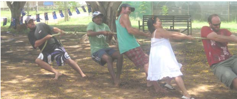
The winning tug a war team in the adults section