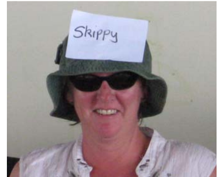
Celebrity heads was played over the BBQ lunch break.