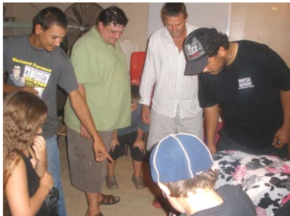
Contestants debating on which coin was closer to the bottle in the coin toss competition.

A big thankyou to the Burke Shire Community for their support & generosity