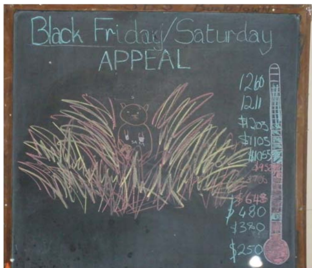
The fundraiser thermometer showing $ raised through the night