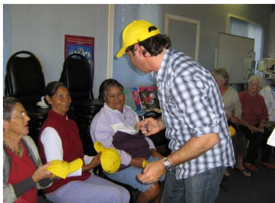
Troy Carrar-Daley signing hats at the Seniors morning tea held at the Burketown Community Hall.

On Wednesday 19 July Troy Cassar-Daley visited Burketown for the day as part of the Gulf tour sponsored by Lagoon Creek. Troy had morning tea and a chat with the Burke Shire Seniors and Councillors where he also gave out hats, signed autographs and sang. He then went to the Burketown State School and conducted a workshop where Gregory Downs & Station children also attended. Troy wrapped up his visit with a free concert held at the Burketown Shire Hall where an estimated 250 people attended.