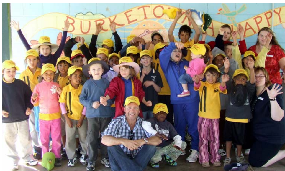
Troy Cassar-Daley with school children that attended the workshop.