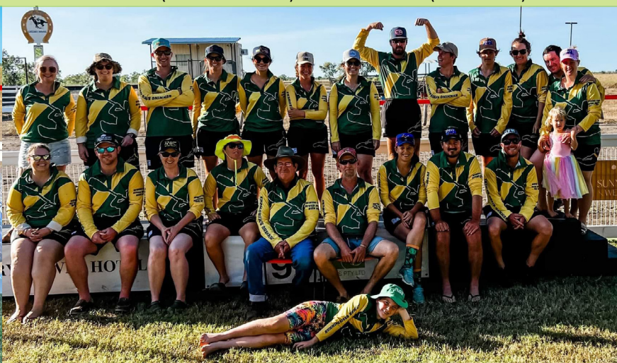
The Running River Rowers