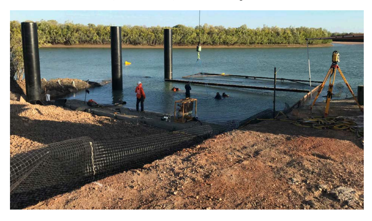
Image: construction of the Burketown Wharf Boat Ramp. The development is designed to improve liveability, promote economic development and improve river access for Emergency Services.