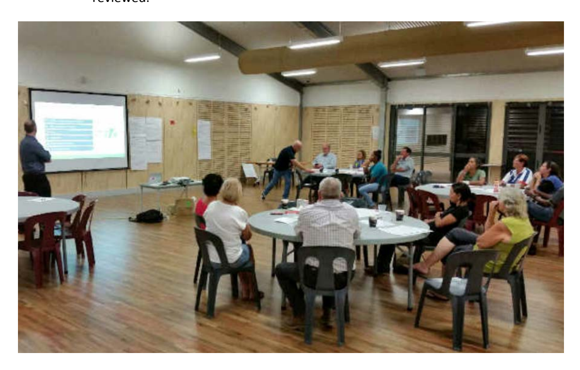
Image: community consultation on the Sport & Recreation Strategy 2019-24. This Strategy will be delivered pursuant to the Corporate Plan 2019-24.