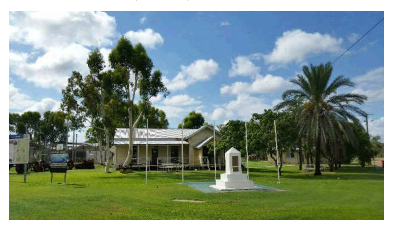
Image: the recently completed restoration of the Burketown Visitor Information Centre (VIC). Tourism is a key regional economic driver in the Gulf.