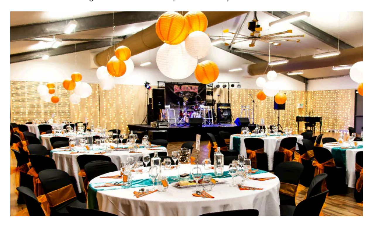
Image: preparation for the 2018 Order of the Outback Ball, hosted in the Burke Shire Nijinda Durlga.