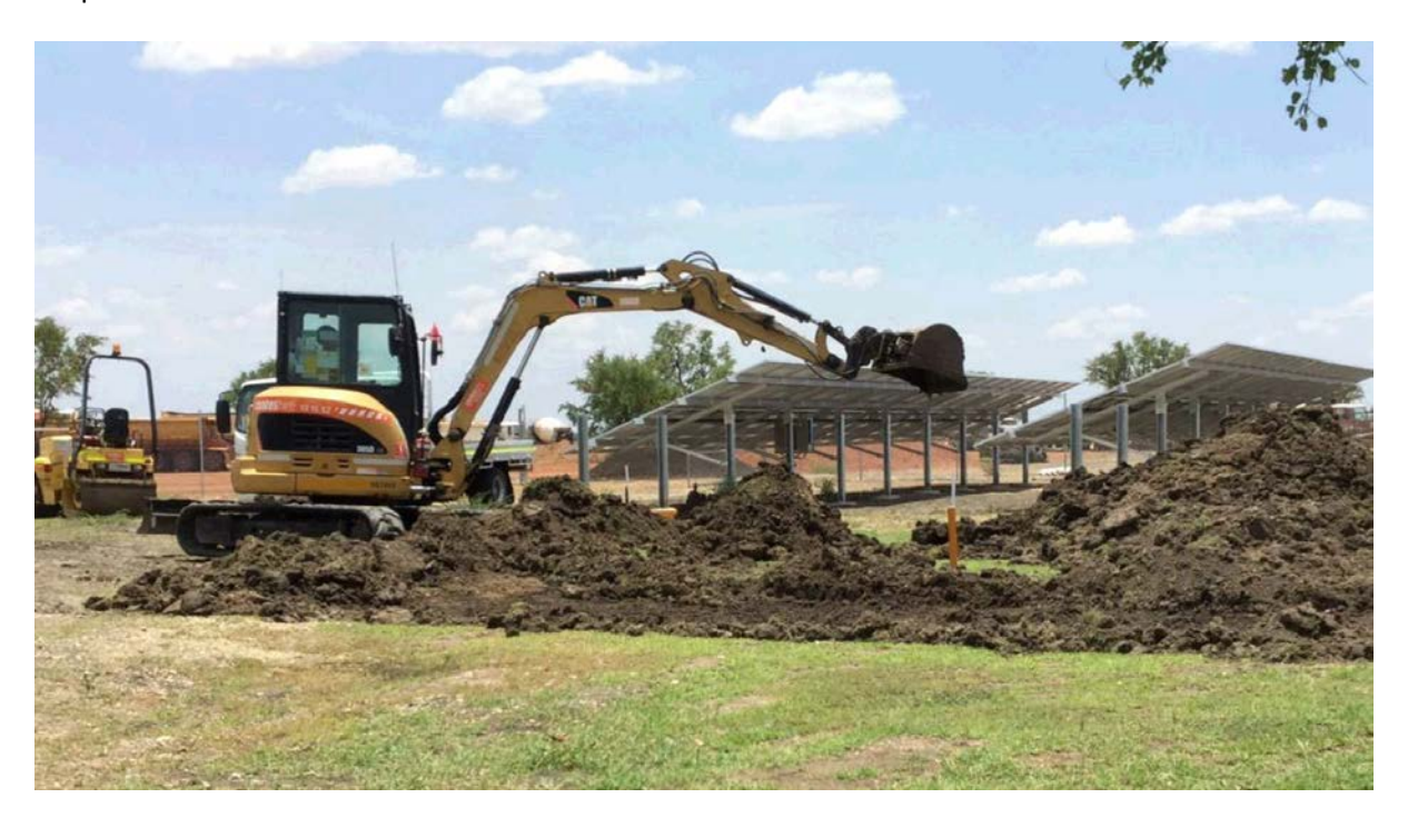
Image: construction of the Gregory Water Treatment Plant Solar Array. Delivering ~$80,000 in energy savings per annum.

The following projects and initiatives are those that Council is focused on delivering over the next five years. Given Council is largely dependent on external funding to deliver Priority Projects, it is difficult to indicate with absolute certainty which projects will be completed in which year of the Corporate Plan 2019-24.